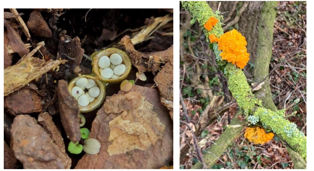
Other attractive fungi found locally Crucibulum laeve Common Bird's-nest and Yellow Brain Fungus

Unusual Coral Fungi discovered in a Wivenhoe garden. Without using chemicals, collecting spores and microscope facilities it is nigh on impossible to identify it to species level. Very interesting find though!