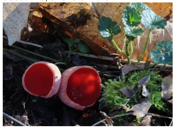
Proceeds of this walk to be donated to Essex Wildlife Trust

Help us hunt the Elf cap – an uncommon fungus, the presence of which helped to save this area of Cockaynes from being turned into a gravel pit. Join our walk to find out about this, and lots more.