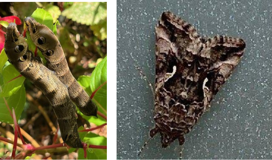
Pair of Elephant Hawk-moth caterpillars and Silver Y Moth