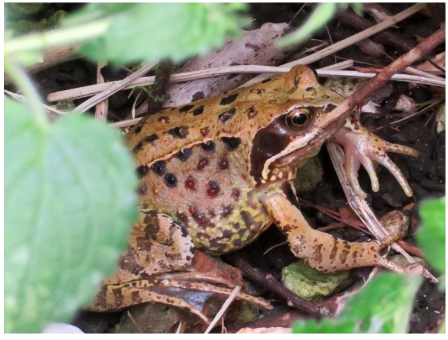
One for the amphibian lovers - super Common Frog