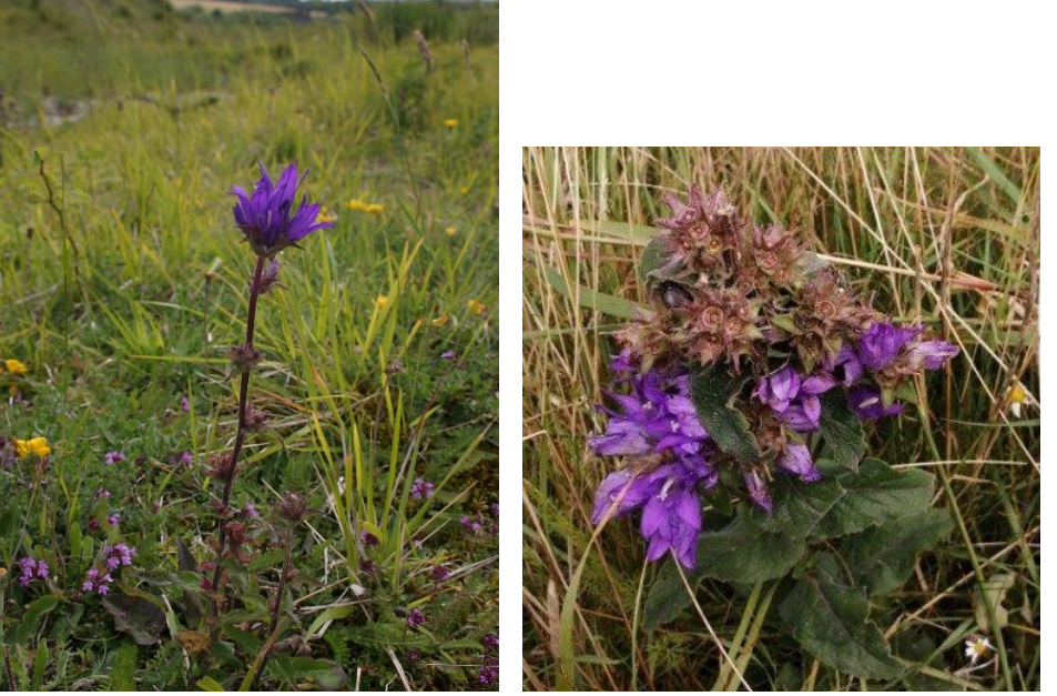
Two Clustered Bellflowers . One has grown to normal height, whilst the other, photographed in Scotland, is much shorter and compact, no doubt due to the wind and temperature conditions.