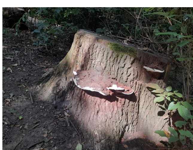
Woodland finds - Oak Marble Gall and a bracket fungus