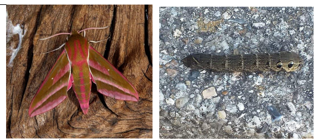
Elephant Hawk-moth adult and caterpillar. The name 'elephant' isn't at all descriptive of the adult but when you see the larva you can see why – it is quite trunky! Thanks to everyone who has reported finding these beasties recently