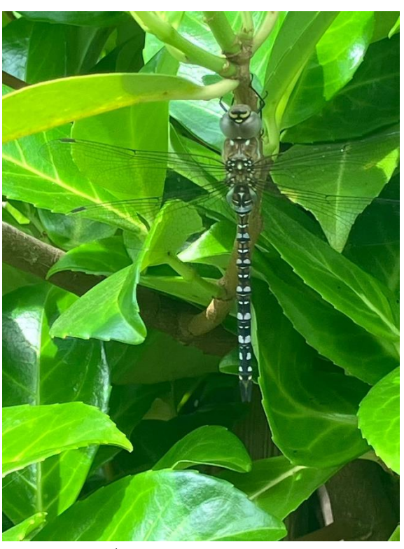
Migrant Hawker Dragonfly