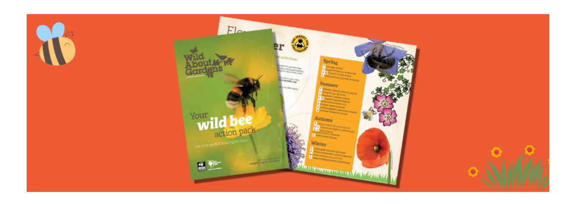
Download your free bee guide here – it's full of useful info on how to help them, identification and lots more. Courtesy of London Wildlife Trust <u>BEES WAG 2017 - Booklet AW new logo web 0.pdf (wildlondon.org.uk)</u>