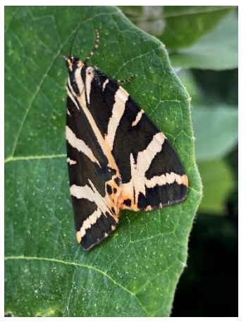
Jersey Tiger, Wivenhoe