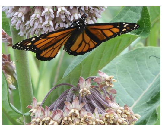
... and some holiday lepidoptera! 9-spotted moths in Slovenia, and representing the butterflies a Monarch in California and below a group of Green-veined Whites congregating in Sweden, taking essential salts from the soil