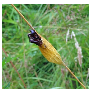
Six-spotted Burnet moth — they are out and about now on our local grasslands and are a delight to behold. Here we have the adult, caterpillar and a newly-vacated chrysalis

WIVENHOE WILDLIFE GARDEN See what has been happening this month in your local wildlife garden. Unfortunately, we found (& removed where possible) a number of plastic bottles and other litter when we visited. If you would like to join in with the next Wildlife Garden working party, please email Stephen Novy stephennovy@outlook.com.