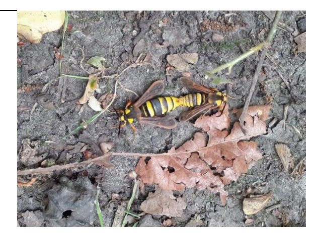
Mating Hornet Clearwings, Suffolk