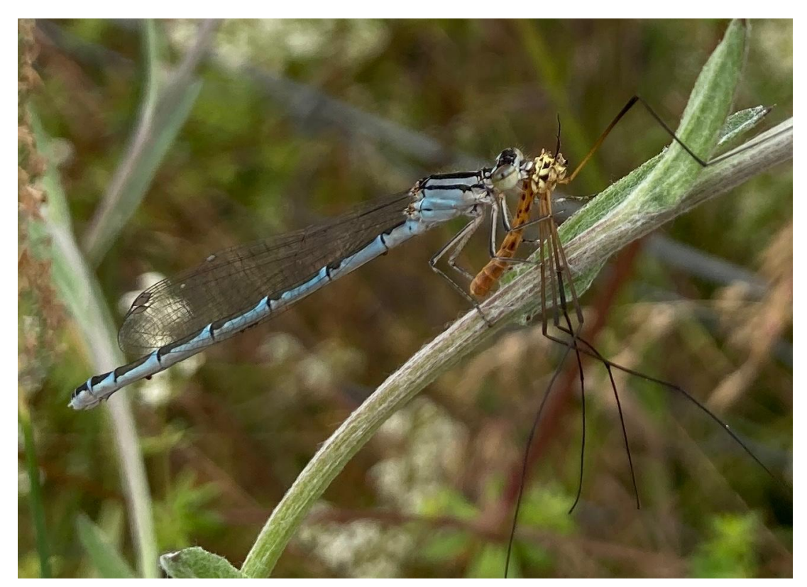
Female Common Blue Damselfly tucking into a tasty cranefly for lunch