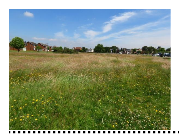
TUESDAY 20TH AUGUST

Evening walk. 'Trees and Bats'. 7pm until late.